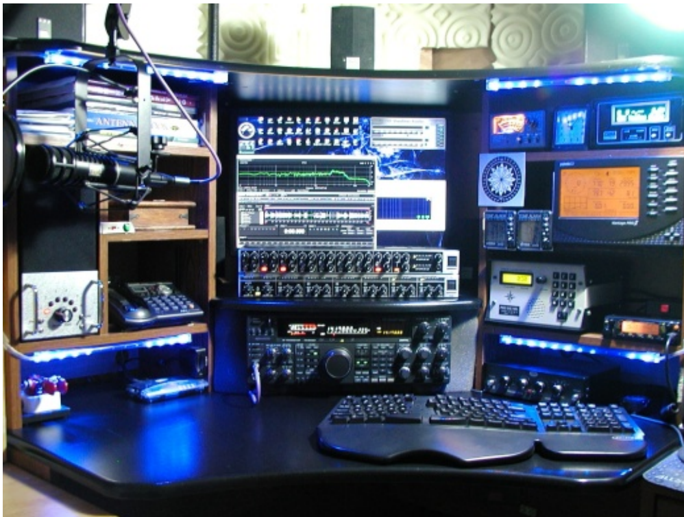
W5UDX Hi-Fi ESSB Voodoo Audio Amateur Radio Station