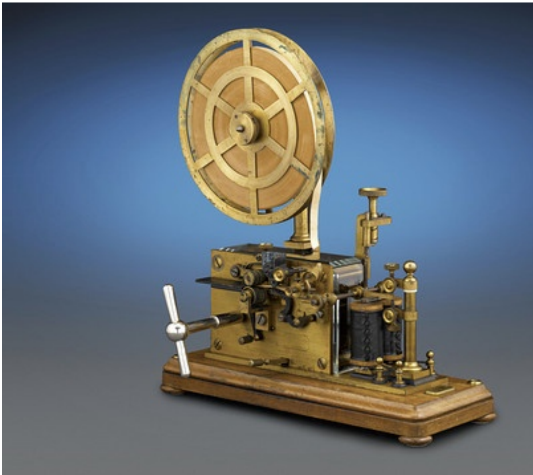
Morse code receiver, recording on paper tape

I hope after reading this article, hams that were considering to learn CW or had it on the 'back burner', will now spring into action. See you on the lower part of the HF bands! • _• _••