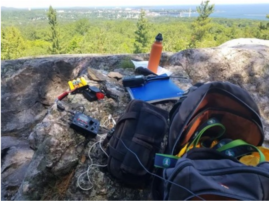
Mikes's WO9B Field day in Michigans UP