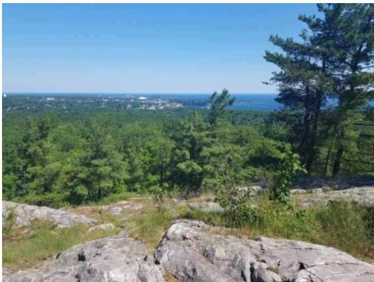
Wide open view