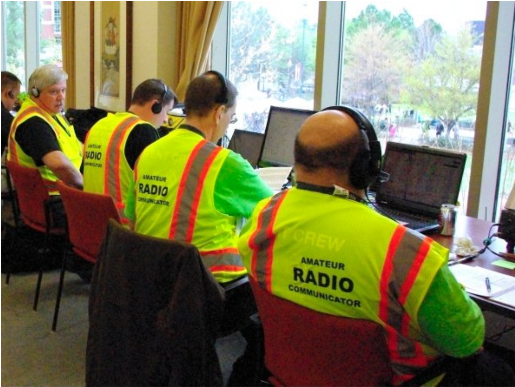
Philippines' Ham Emergency Radio Operations Net Activates for Super Typhoon

hurricanes like Katrina, Maria, and Sandy, where key infrastructure was destroyed. Even if you don't think the time and investment is worthwhile, even looking into these options may transform the way you think about emergency readiness . . . .