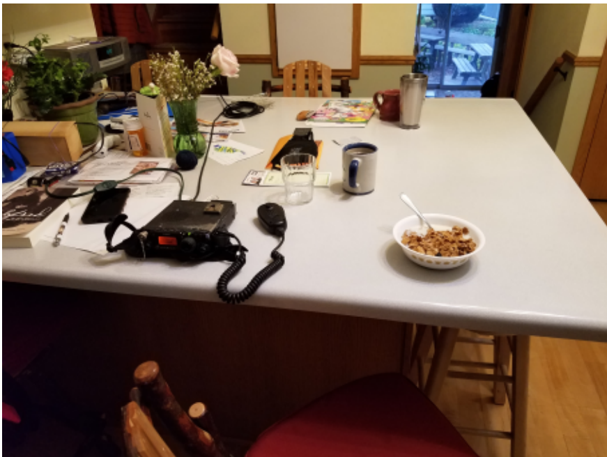
My morning nut net breakfast shack HI HI