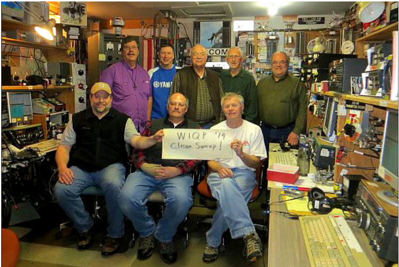
The gang at W9EAU celebrates their "big thrill" - a Clean Sweep in WIQP 2014!