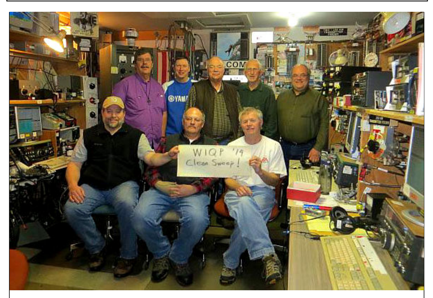
The gang at W9EAU celebrates their "big thrill" - a Clean Sweep in WIQP 2014!